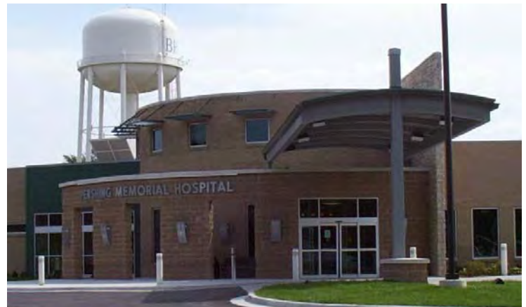
Pershing Memorial Hospital